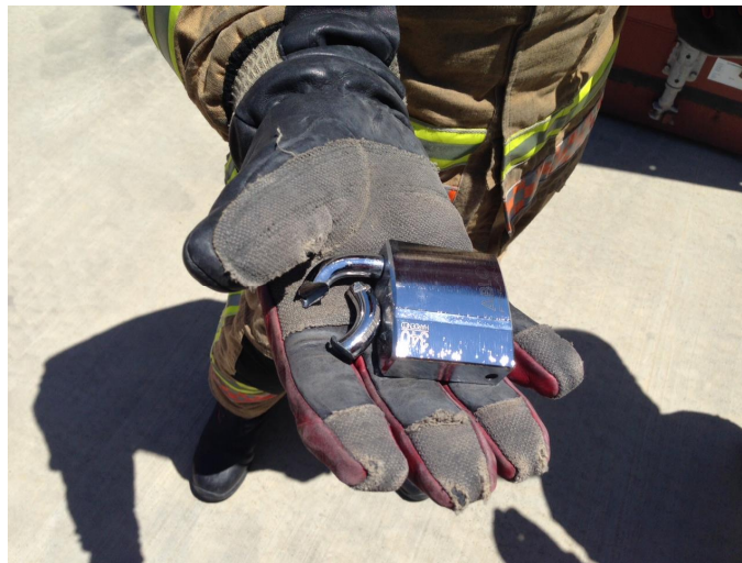
Our ISO container was a little more secure than expected!

See below for some souvenir photographs: