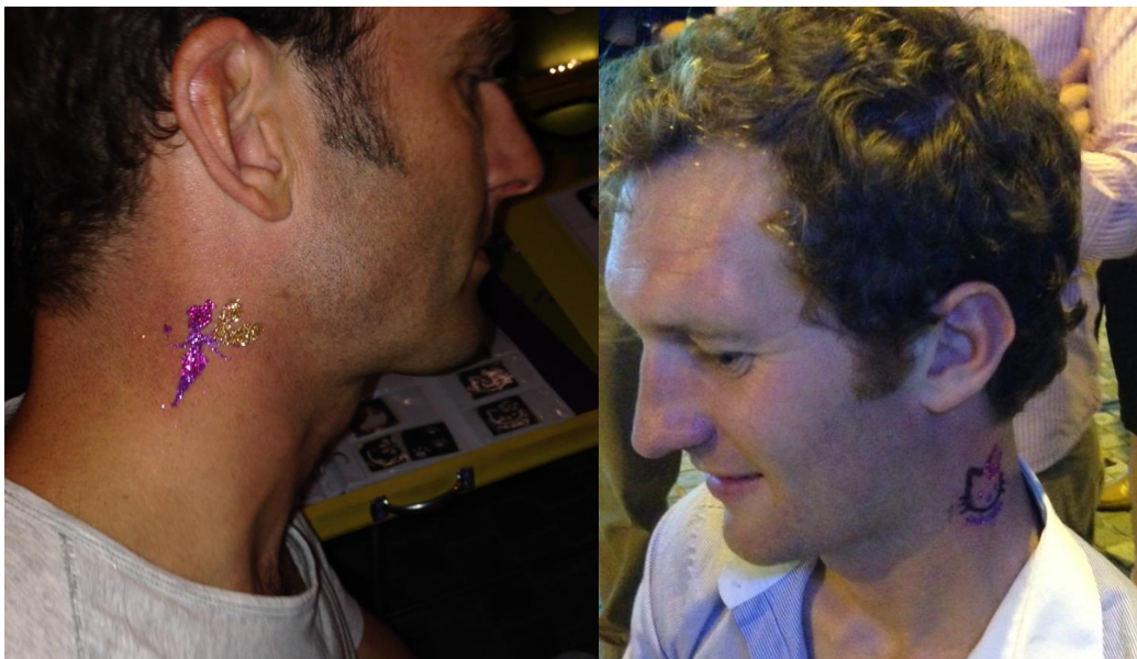
The official Junta Leader hand-over tattoosõ